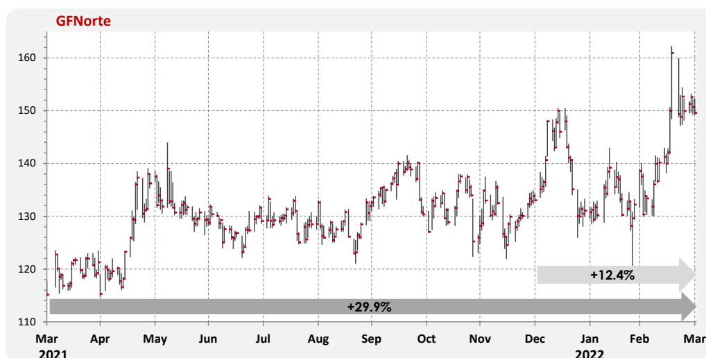
Graph 3. Stock Performance

The financial group reported Earnings Per Share of Ps 3.728 in 1Q22.